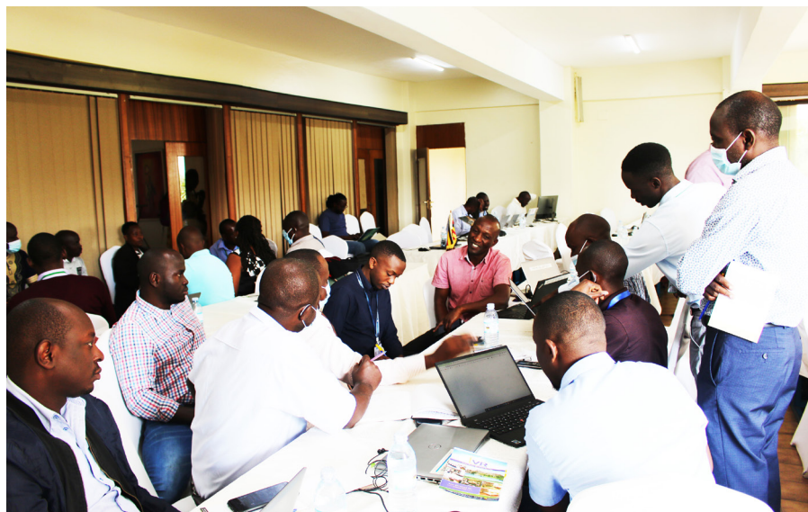
Focus group discussions on Data Quality improvement in UgandaEMR

the implementation of facility-based interoperable EMRs such as the UgandaEMR and ClinicMaster, among others through its above site implementing mechanisms; the Makerere University School of Public Health Monitoring and Evaluation Technical Support (MakSPH-METS) and Strategic Information Technical Support (SITES). The current implementation of UgandaEMR is in over 1,360 public health facilities as of June 2022.