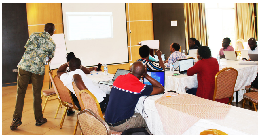
Focus group discussion on HIV testing services- ART card revisions

He re-echoed the commitment of the Ministry of Health to support the review from the beginning to the end even with the existing competing activities.