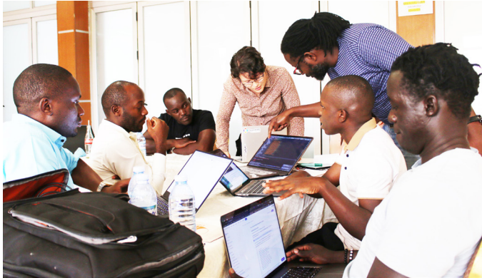
Developers during the second boot camp held on 30 th May - 2 nd June in Jinja