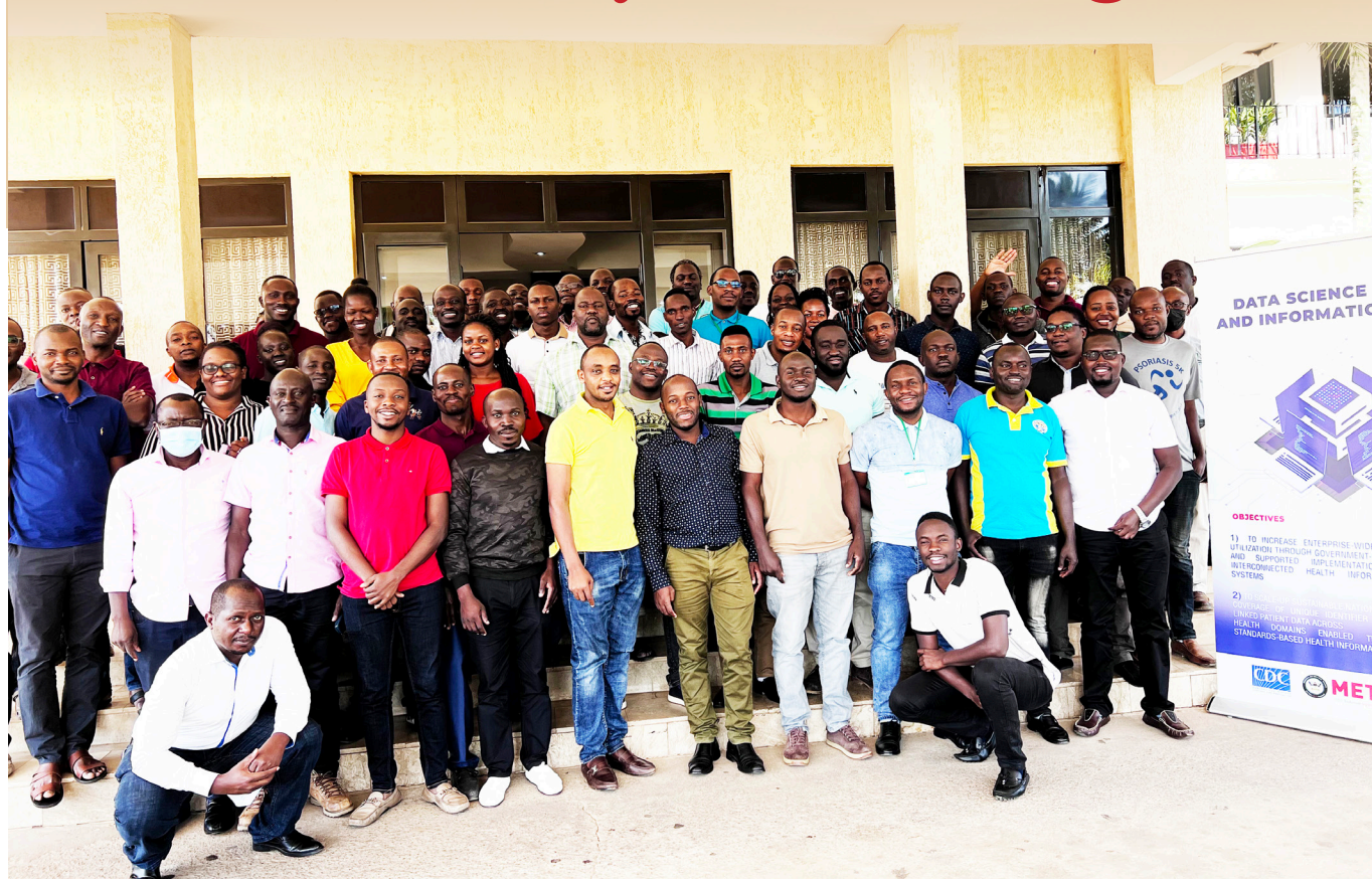
Group photo at the UgandaEMR stakeholders' meeting held in Mbarara on 27 th June- 1 st July 2022