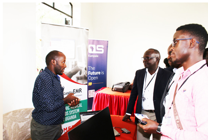
Captured moments at the event