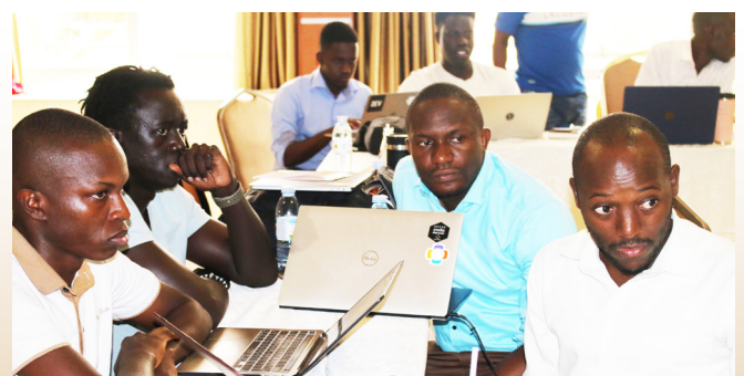
Discussion on packaging and deployment of UgandaEMR

The METS team will fast track the systems development process to ensure that the product is tested and deployed at public health facilities catering for both retrospective and Point of Care approaches.