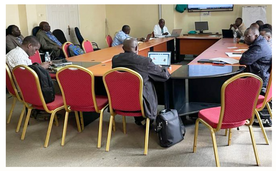
Debrief meeting at Baylor-Uganda, before proceeding to the health facilities

Key lessons from the field trips included the need for Implementing Partners to prioritize routine support as well as the motivation of super users who play pivotal roles. Innovative tools like WhatsApp groups were also deemed