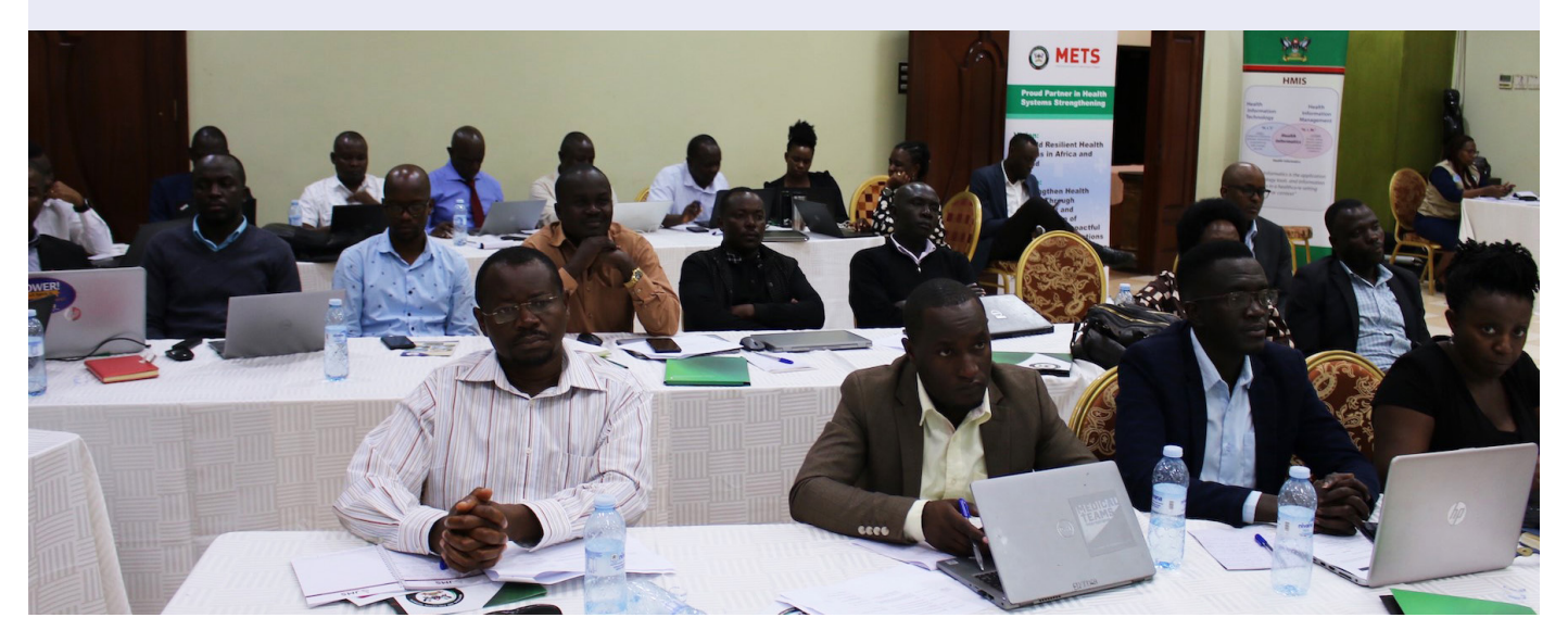
Some of the participants at the meeting

stakeholders from the Ministry of Health-AIDS Control Program (MOH-ACP), PEPFAR Coordination Office, US Government Agencies, and various implementing partners.